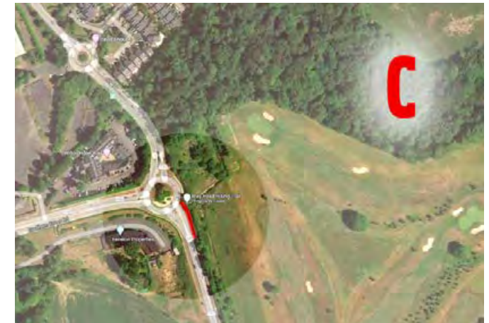
Six Biodiversity areas in Bray with signage - 2020, 2021